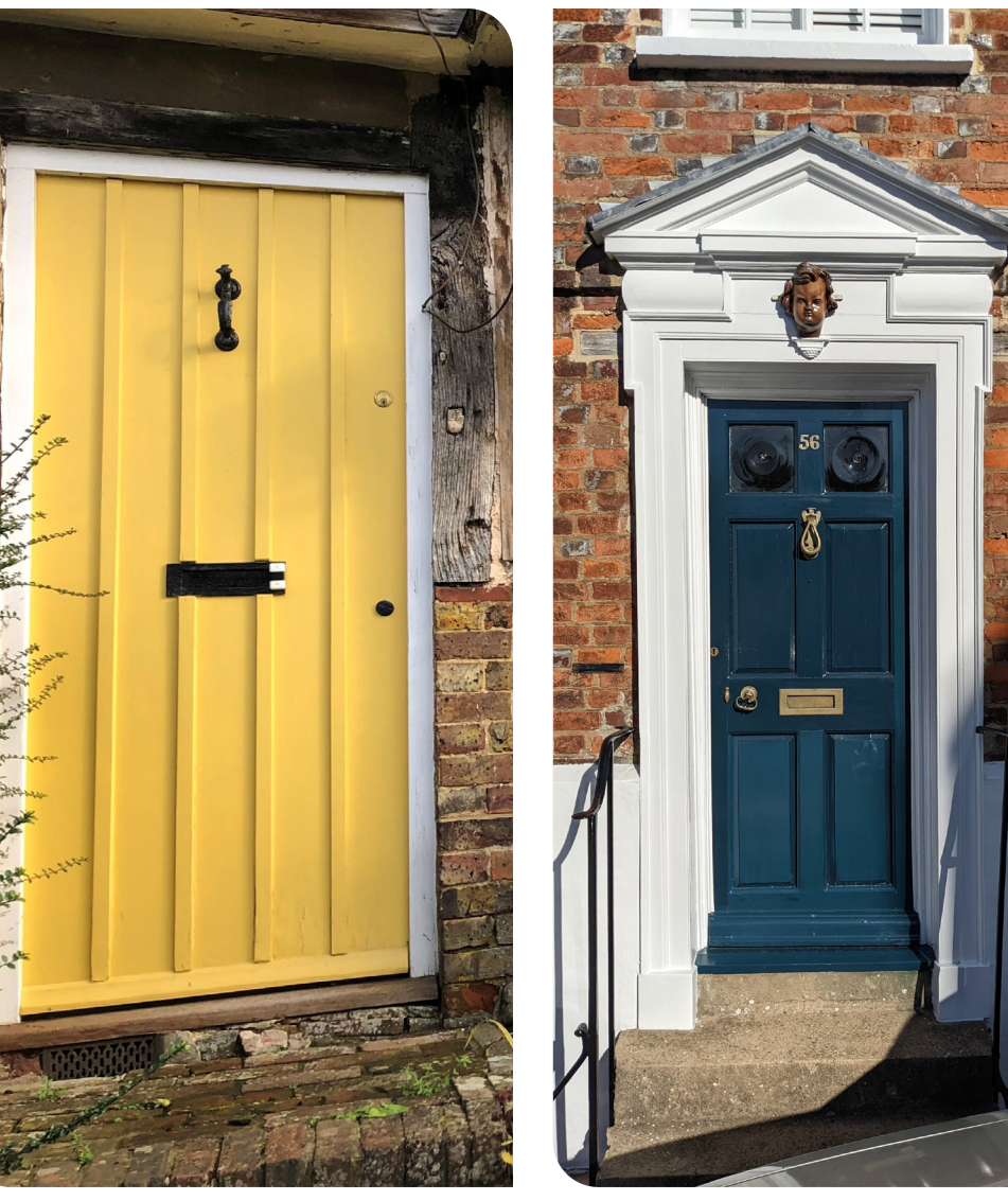
Traditional vernacular planked door