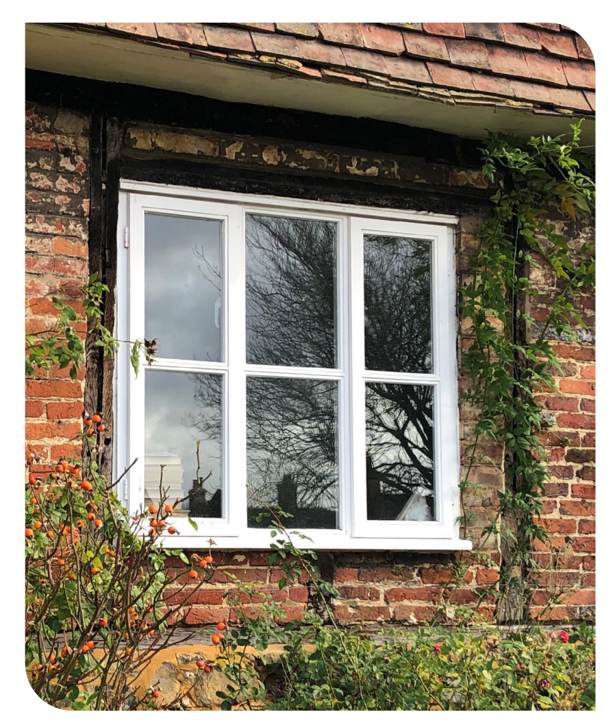
Softwood timber casement window