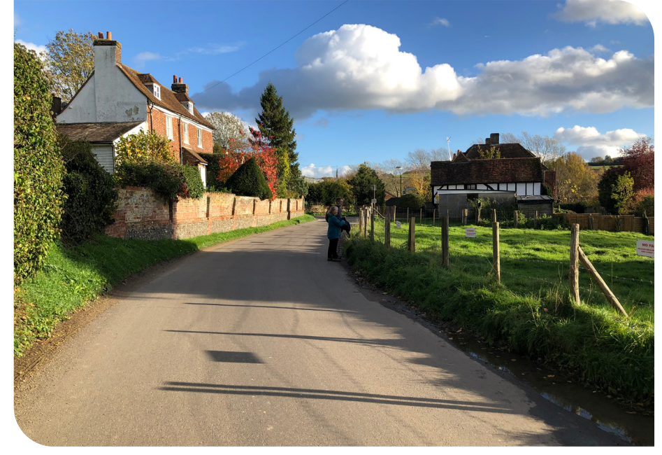
Any proposal for an extension or new building need to consider how it will be viewed from streets, public rights of way and across open space