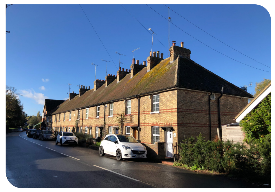
A terrace, note the rhythm of windows and chimney stacks and the continuous roofline