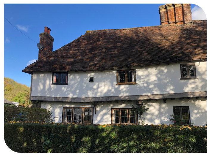
Lime render has been applied to buildings for centuries, in this case to a timber-framed house