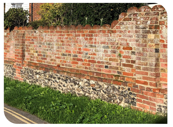
Boundary wall of handmade brick, with knapped flint base and decorative copers