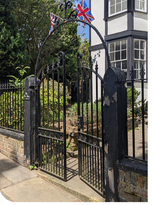
Nineteenth century cast-iron railings and gates