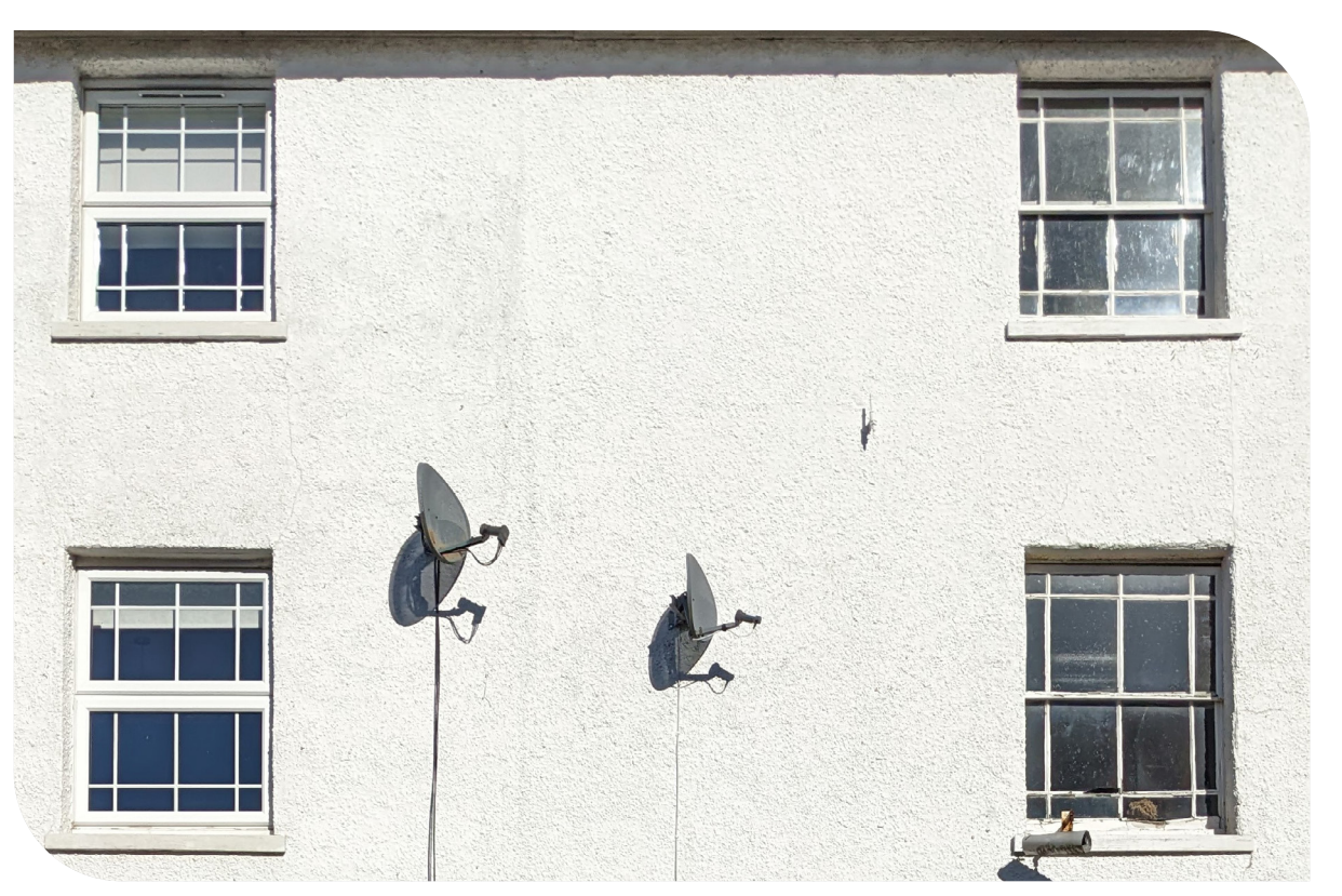
Historic timber sash window, right, and replacement uPVC windows, left. The pebble-dashing and satellite aerials are also non-traditional elements that harm character and appearance

Window surrounds require careful thought too: in timber-framed buildings window lintels and cills are oak, and sometimes part of the frame. In brick buildings, a shallow brick arch spans across the window and is usually attractively constructed of special 'cut and rub' bricks and fine jointing; cills are either wood or sometimes stone, and detailed with a slope or 'fall' to shed water.