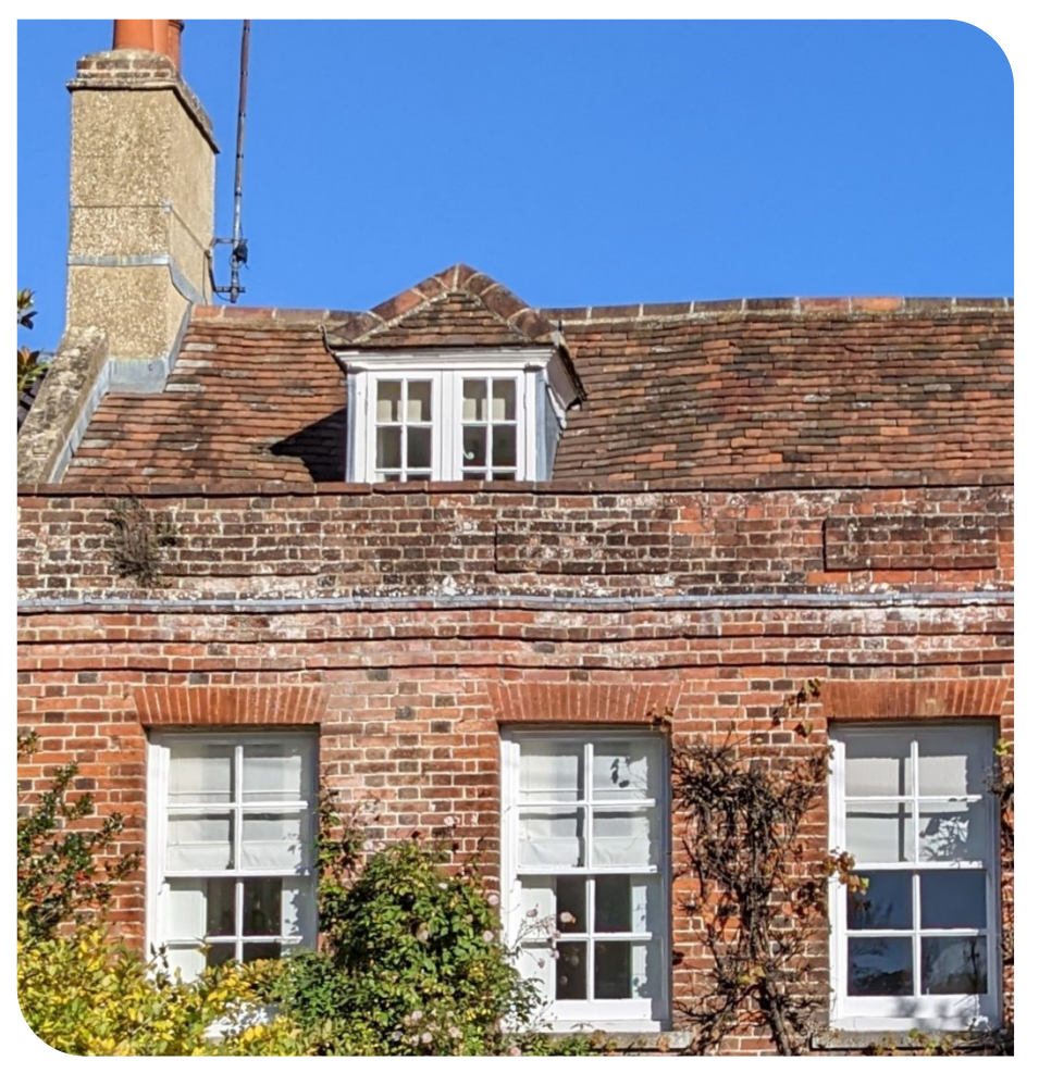
Kentish 'peg tiles', irregular roof line and dormer window. Traditionally, where they are used, dormer windows are small and visually subservient