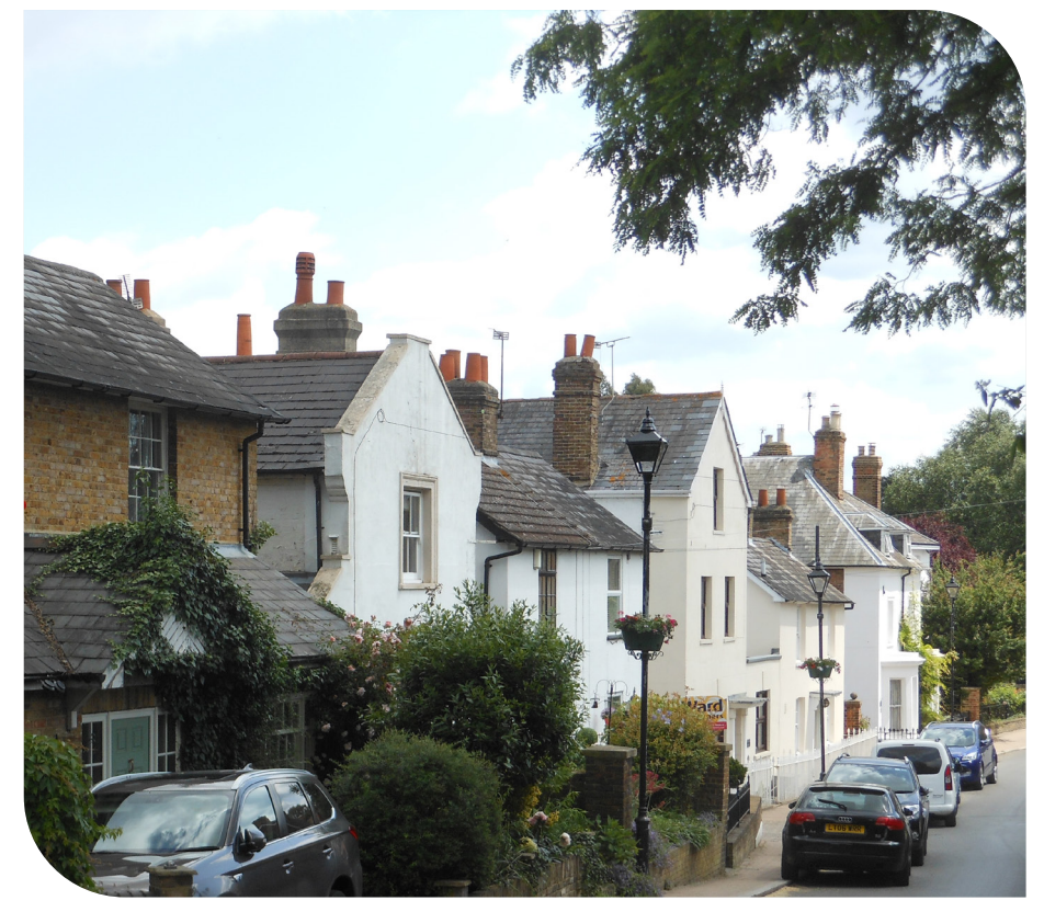
Chimneys make a strong contribution to the character of roofcapes and skylines