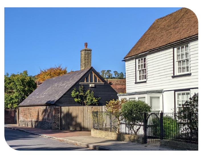
Weatherboarding is sometimes used to clad houses, and usually then painted a pale shade; more often it is employed to clad ancillary or farm buildings, when it is traditionally tarred black if softwood is used