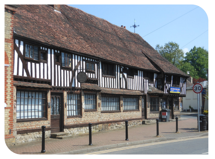
The District has a tradition of buildings made of oak frames, with painted plaster panels