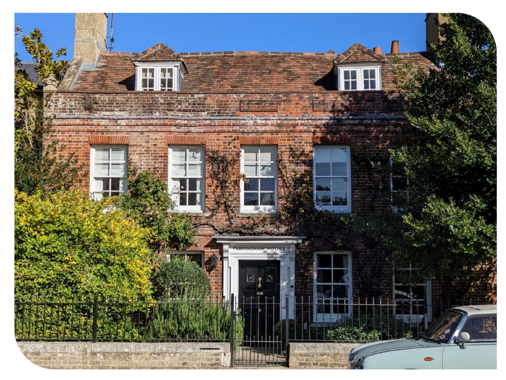
Handmade brick, with flush lime pointing