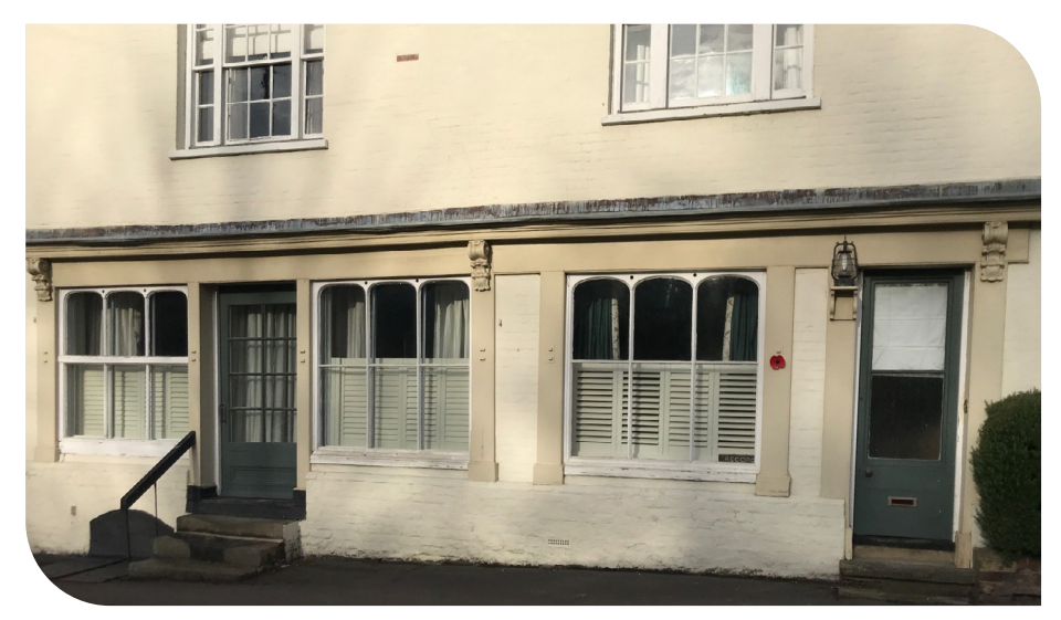
Historic shopfront, carefully retained