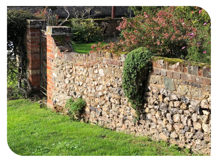
Knapped flint wall with brick detail and a wrought-iron gate